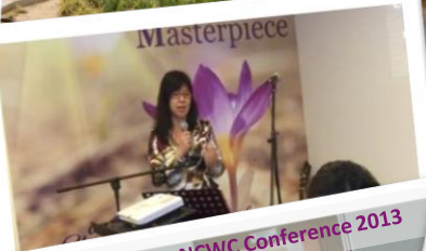
Girls in action at NCWC Conference 2013